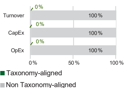
1. Taxonomy-alignment of investments including sovereign bonds*